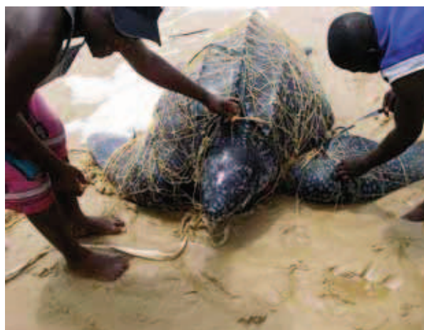
Fig. 4.- Leatherback caught in the fishing net.

Thanks to this program, more than 1500 turtles have been released each year since 2005 (Fig. 6, 7, 8). The importance of the release program is manifold: