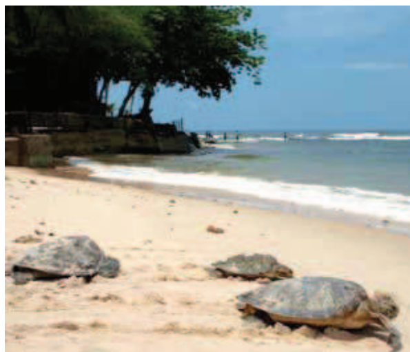
Fig. 8.- Release of green turtles accidentally caught in fishing nets.