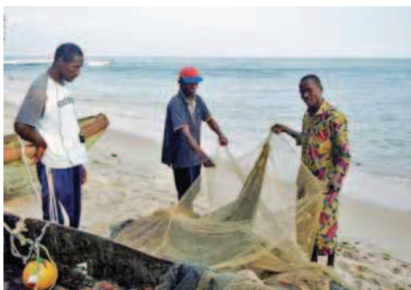
Fig. 5.- Damage to the fishing nets is evaluated and the necessary amount of net provided.