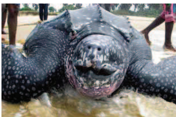
Fig. 6.- Release of a leatherback turtle accidentally caught in fishing nets.