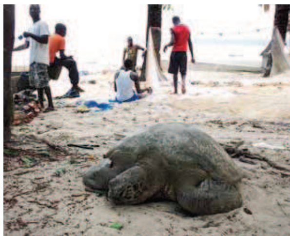
Fig. 7.- Green turtle accidentally caught in a fishing net waiting for its liberation.

Since May 2009, Renatura proposes several tourist activities to discover sea turtles in the field. A portion of the income from tourism is used to fund some of the NGO activities. The other portion is used to promote micro-projects chosen by the local communities. This programme has already enabled one of the villages to fix a water-