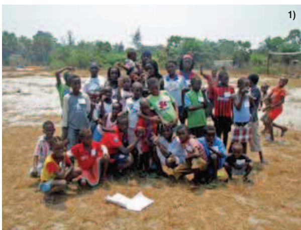
Fig. 1, 2, 3.- Leisure activities in coastal villages during holidays.

To bring environmental education to children and youth, the actors of tomorrow's Congolese society, our education team implements interactive methods in private and public schools and through leisure activities in coastal villages during holidays (Fig. 1). Every session is built according to the David Kolb pedagogical method, based on interaction and adapting the information delivery to each type of learner. A large variety of activities are implemented in each session (working groups, testimonies, theatre sketches, games) (Fig. 2, 3). Results are assessed through questionnaires undertaken before and after each education session. In addition, during summer holidays the Renatura education staff organises environmental games and leisure activities in remote villages for children and youth, as well as movie projections at night.